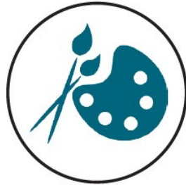
Arts, Culture, and Events