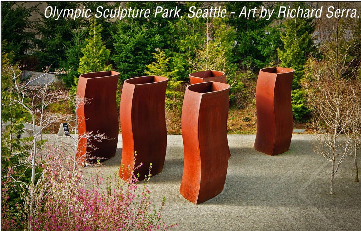
SCULPTURE GARDEN (PUBLIC ART EXTERIOR)