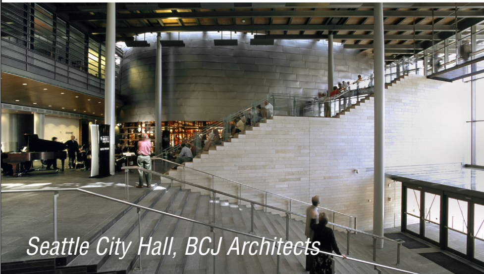
COMMUNITY EVENT SPACE (COMBINED WITH FLEXIBLE LOBBY AND FORUM STAIR)