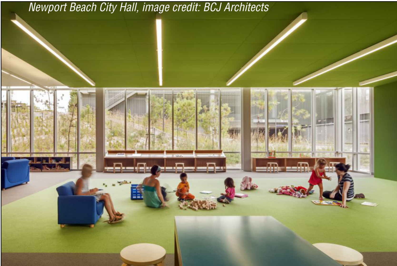
CHILDRENS ROOM / PLAY AREA