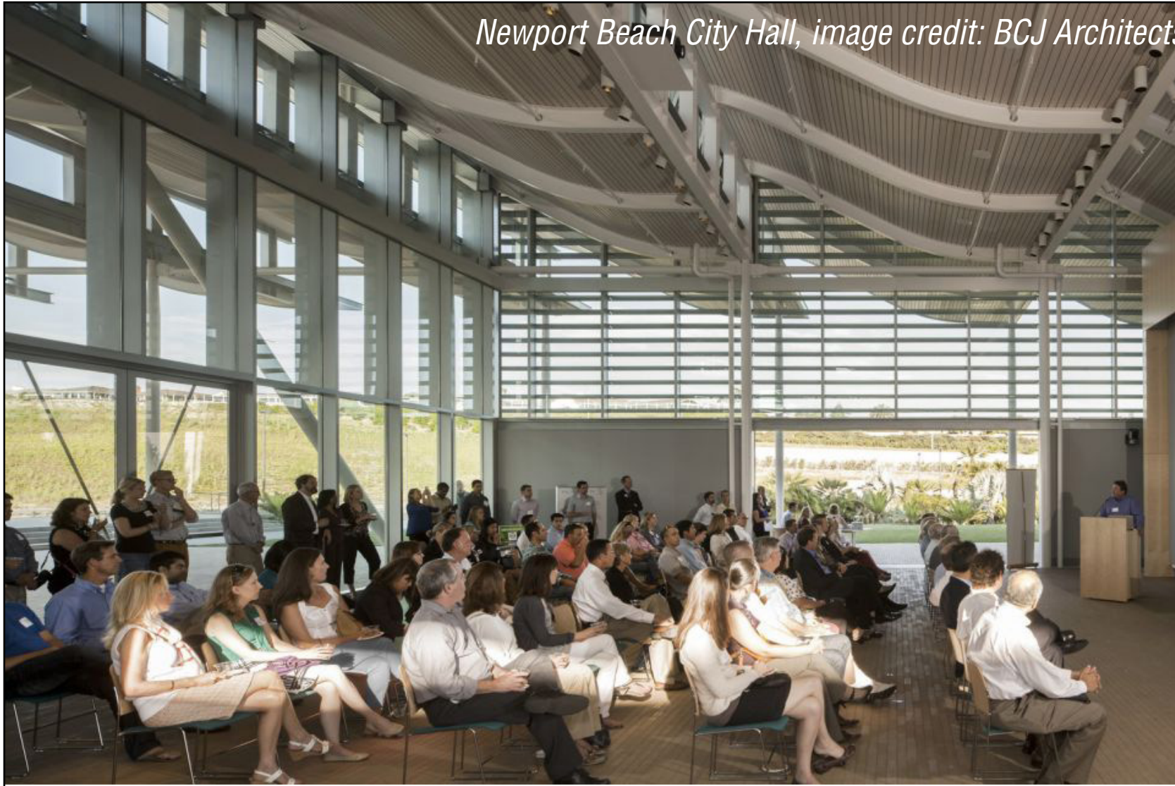
COMMUNITY MEETING SPACE (DEDICATED ROOM W/ SEPARATE ENTRANCE)