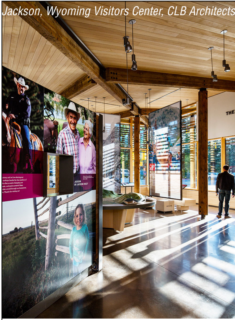
WELCOME CENTER / INFO CENTER