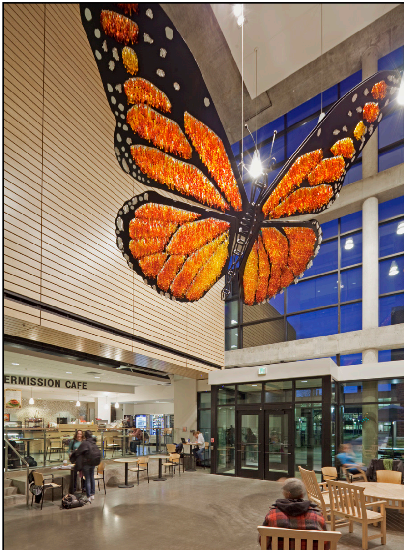
PUBLIC ART (INSIDE THE BUILDING)