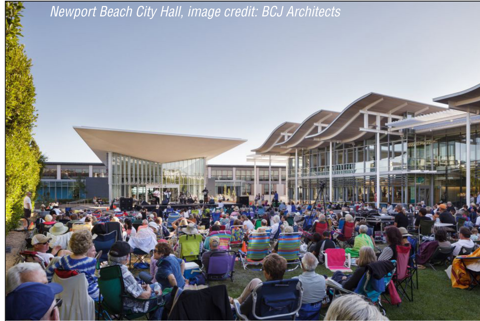
INDOOR / OUTDOOR EVENT SPACE (CIVIC CENTER FESTIVALS / EVENTS)