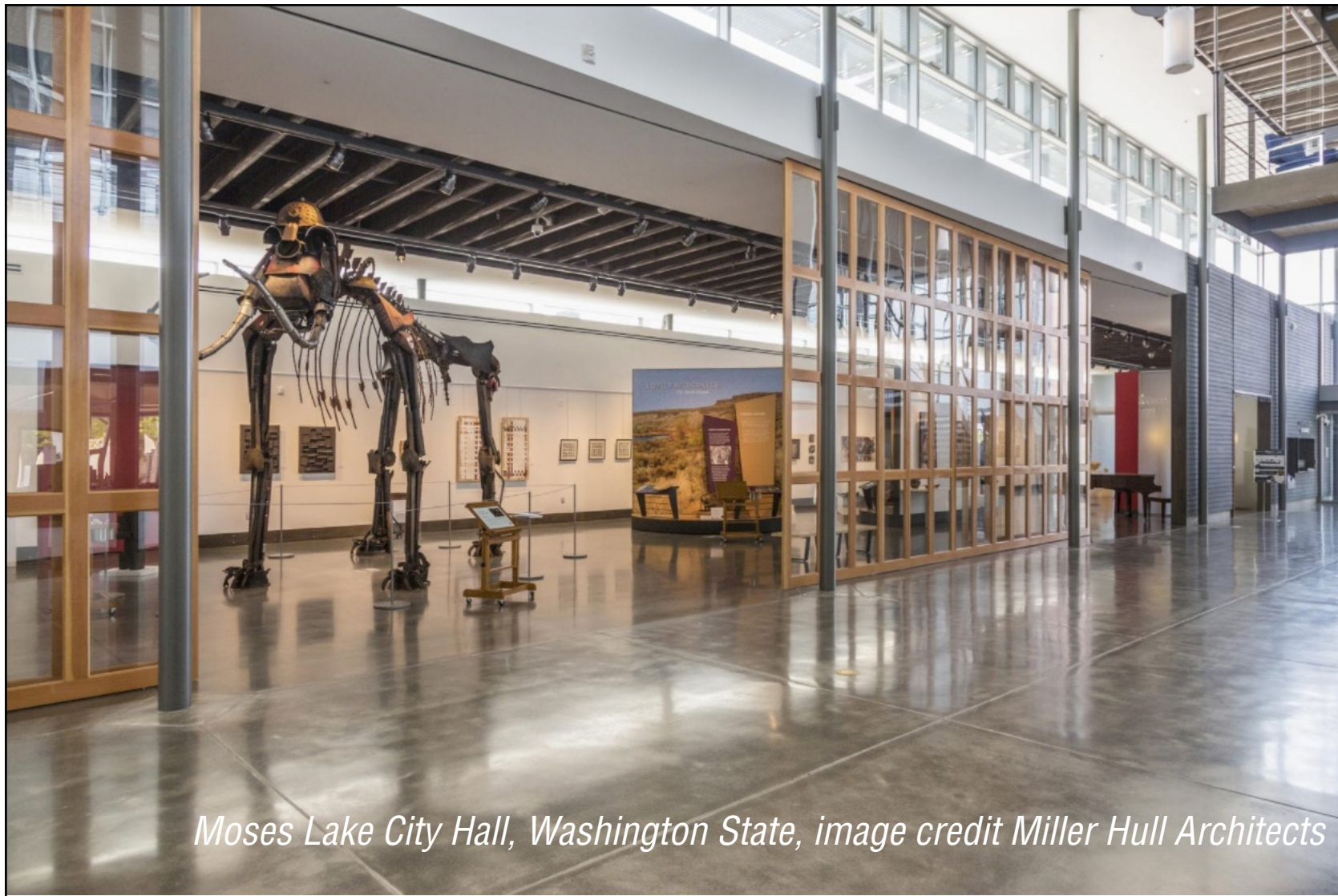
NORTHGLENN HISTORY CENTER