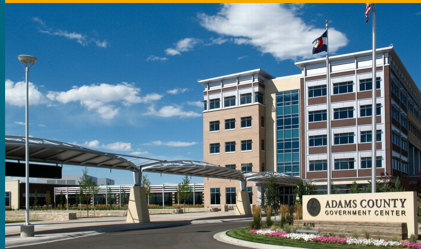
Adams County Government Center in Brighton

Please note, these are all public entities, not private industry. You may visit www.shopnorthglenn.org for a directory of local businesses.