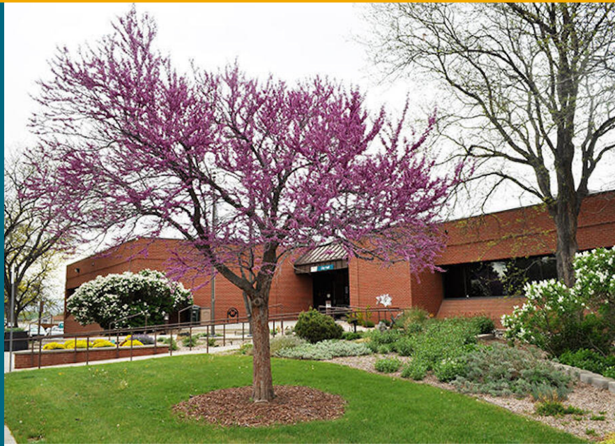
City Hall, 11701 Community Center Dr.

Welcome to Northglenn - where families and businesses can thrive! Our city officially turned 50 in 2019, though the area grew from the Perl-Mack subdivision dubbed "the most perfectly planned community in America" by Life magazine and the National Association of Home Builders in 1961. Today Northglenn covers 7.5 square miles, and is home to 39,000 residents and 1,000 businesses.