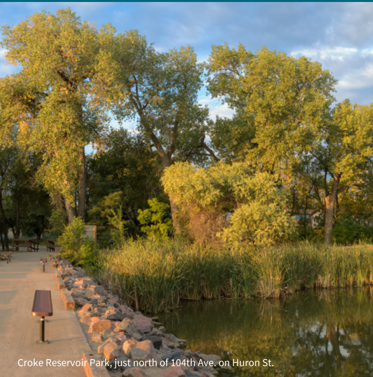
Croke Reservoir Park, just north of 104th Ave. on Huron St.