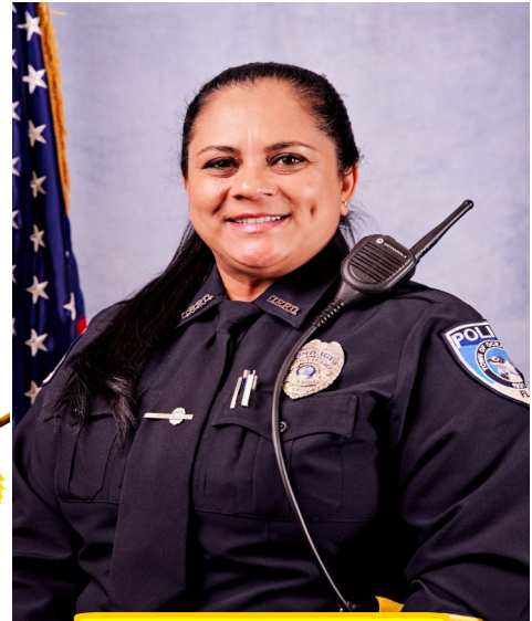
Employee of the Quarter