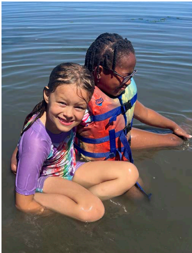
Explore, splash, dig, build, play!