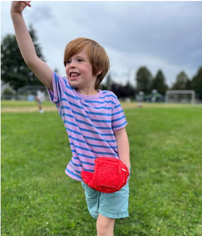
Get your little one moving and shaking with us in Gymnastics or Sports for Life .