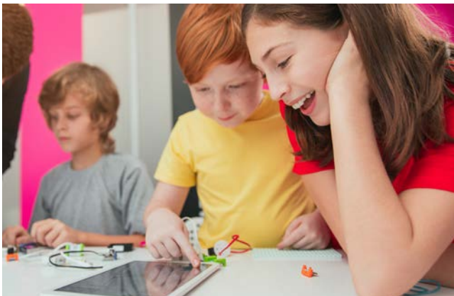
Our tech camps are interactive and fun!

M-F Jun 24 - 28 ● 9:30 AM - 4:30 PM $325 12262