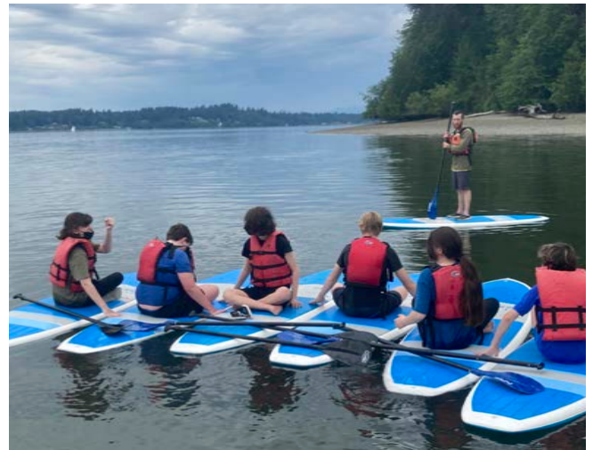
Explore the Salish Sea with us!