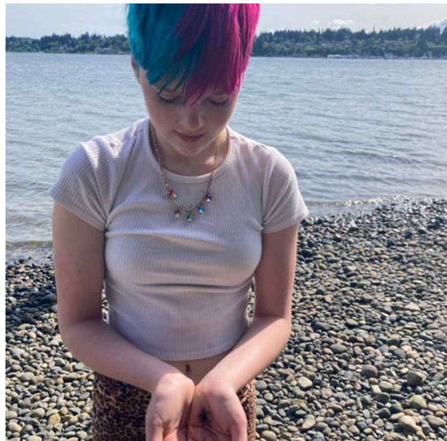
Spend the summer hanging with peers.