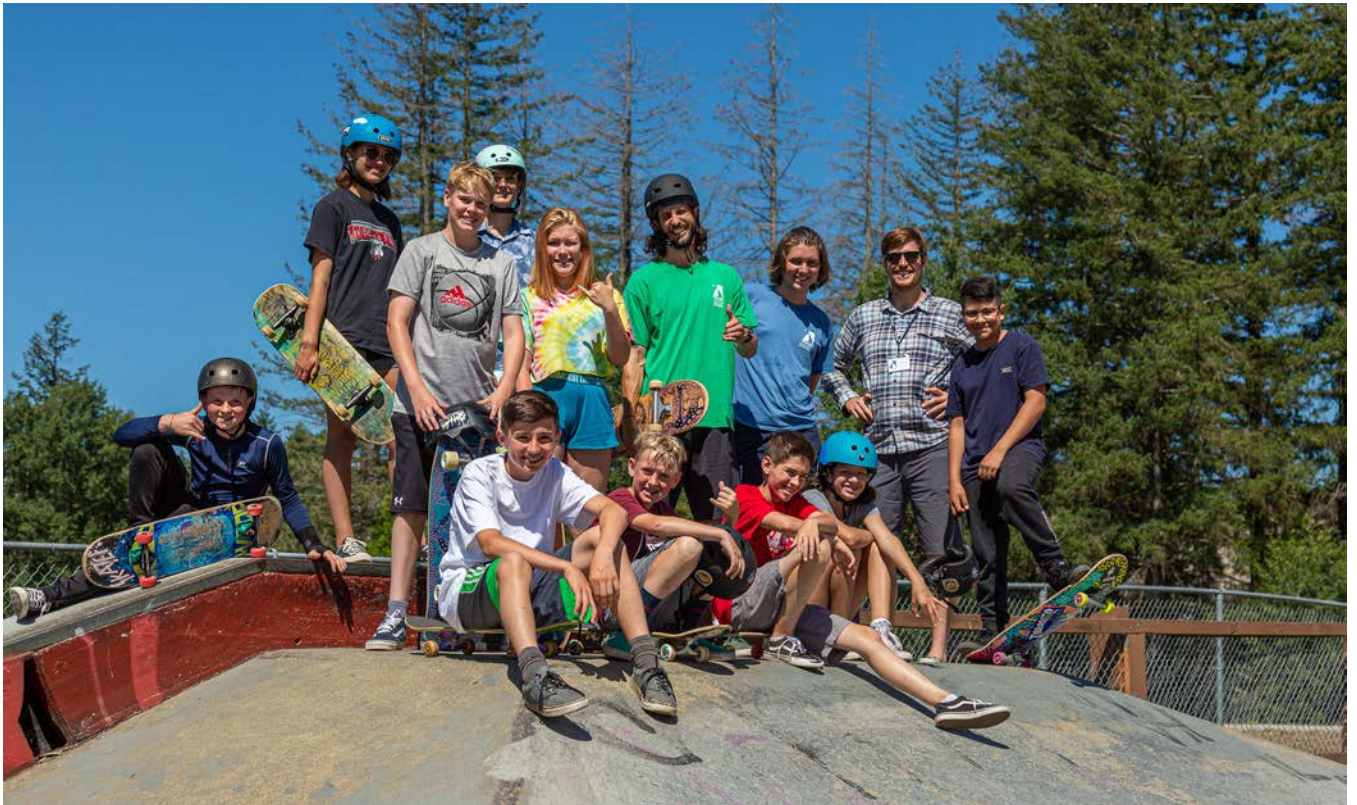
You'll probably take a tumble, whether your doing gymnastics or skateboarding!