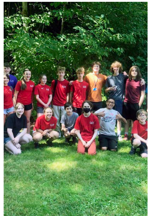
Join the LIT crew this summer!