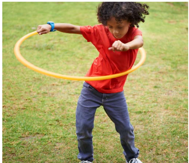
What's more fun than hooping in the sun?!

M-F Jul 15 - 19 ● 9:00 AM - Noon $259 12246 M-F Jul 15 - 19 ● 1:00 - 4:00 PM $259 12247 M-F Aug 19 - 23 ● 9:00 AM - Noon $259 12248 M-F Aug 19 - 23 ● 1:00 - 4:00 PM $259 12249