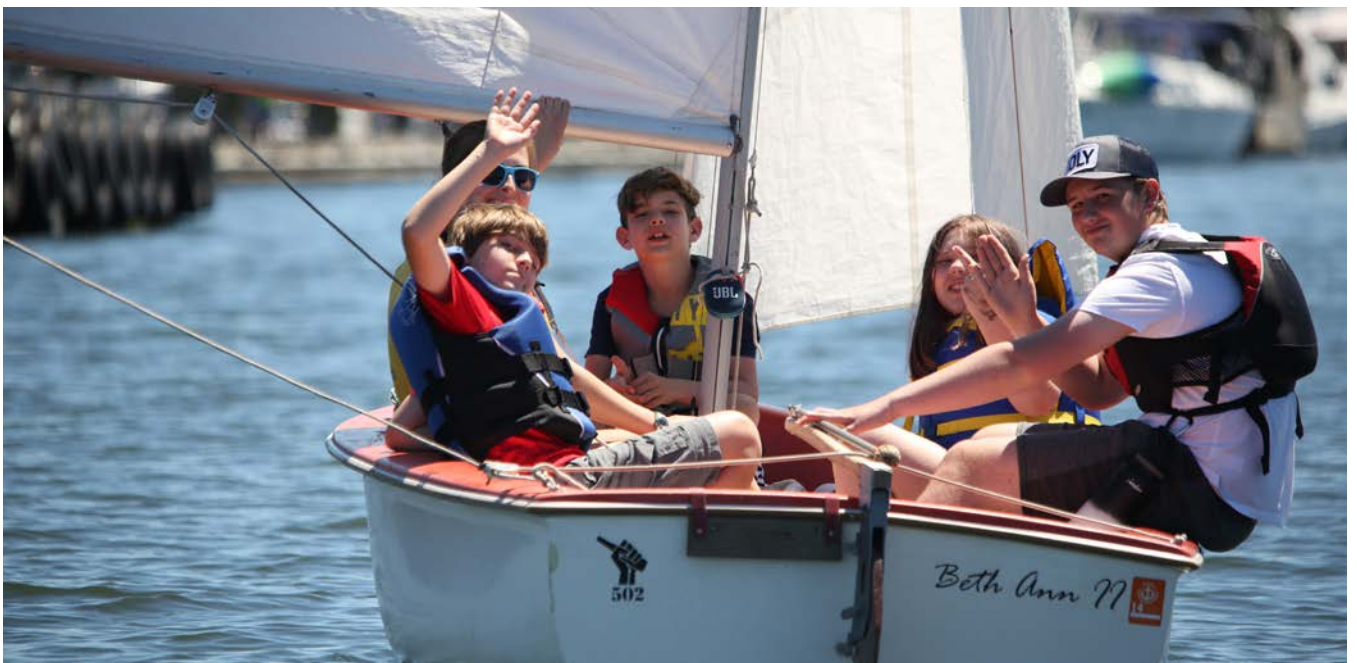
Combining sailing with science makes for a fun and engaging camp experience.