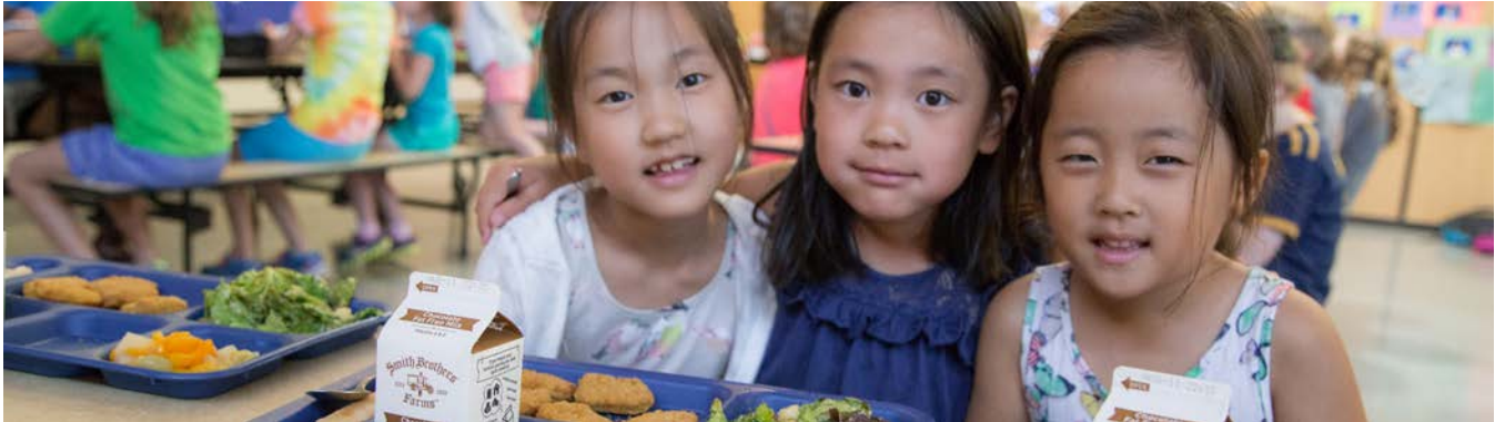
Have lunch with us all summer at Roosevelt and Garfield Elementary Schools.