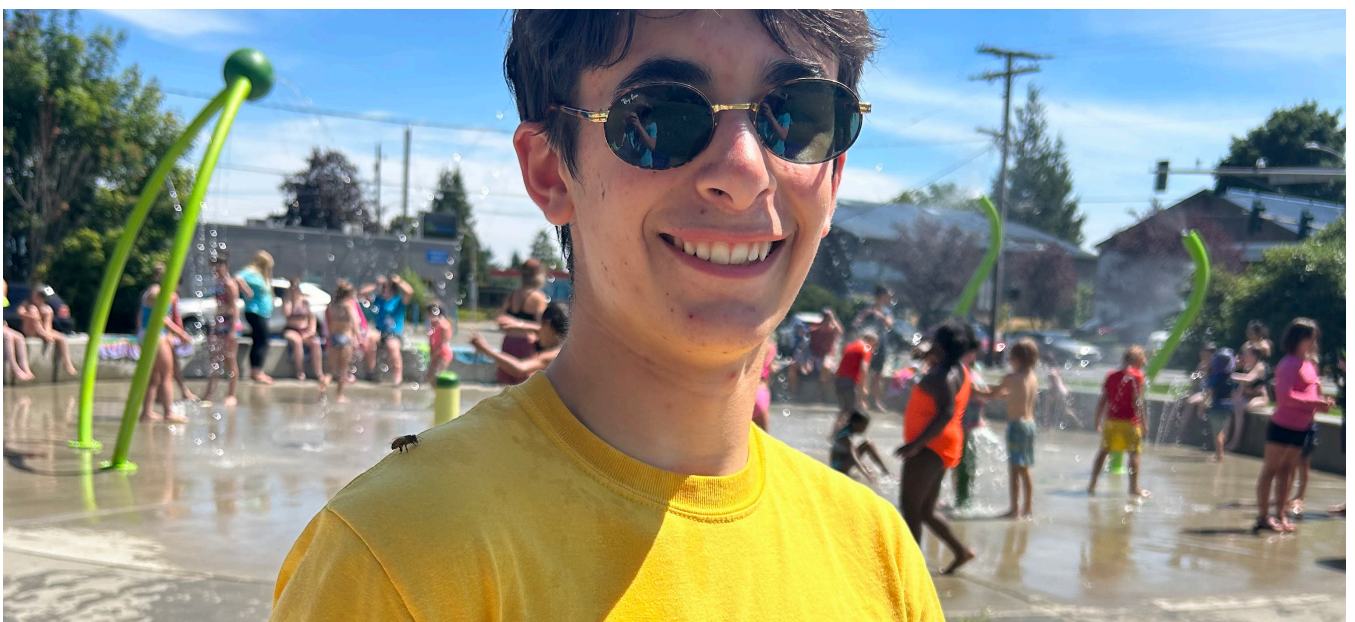
Our counselors make the FREE Summer Kids in Parks Program (SKIPP) tons of fun!