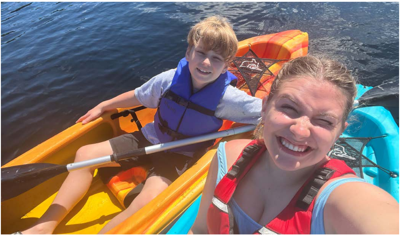
Variety Camp gives your camper just that - variety! Each day is different and fun-filled.