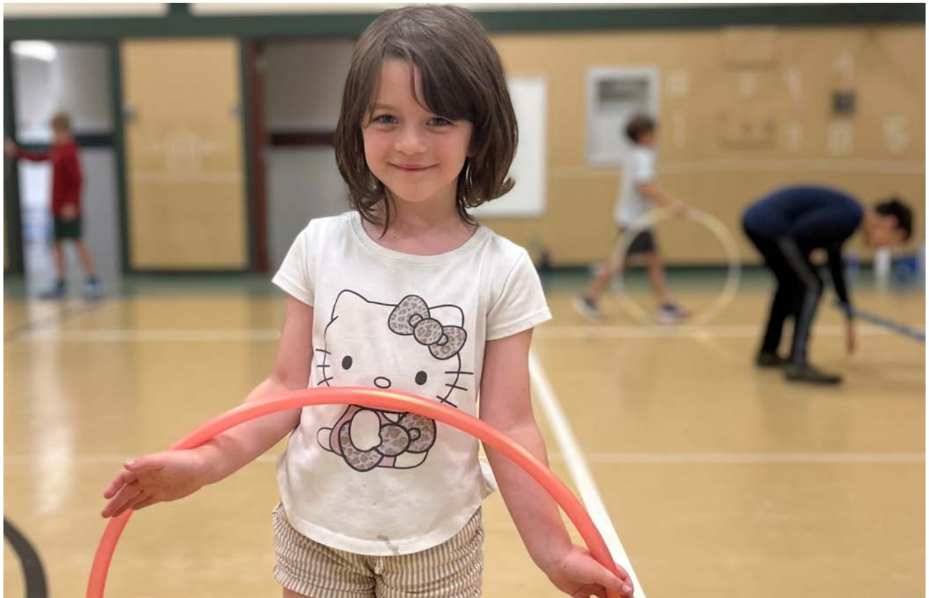
Your littles will love to tumble with us!

M-F Aug 12 - 16 ● 9:30 AM - 12:30 PM $95 12227