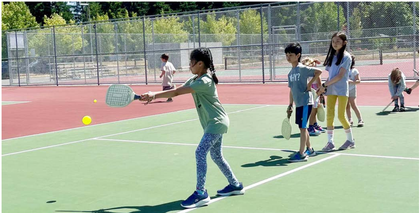
Sports for Life is a traditional day camp, with a fun focus on sports.

M-F Aug 19 - 23 ● 7:30 AM - 5:30 PM $175 12229