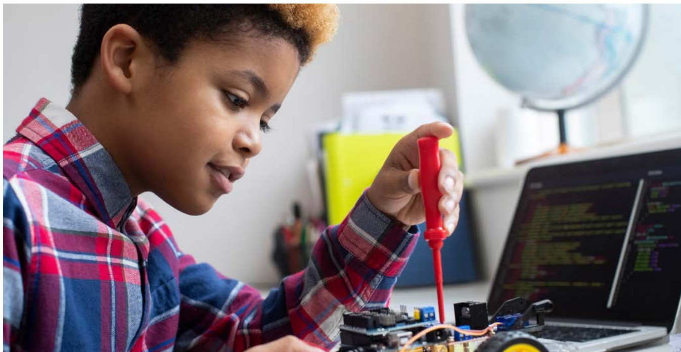
Bricks for Kidz LEGO®, robotics, and tech camps have something for every age and ability.

6-year-old campers may sign up for both Junior Builderz (p. 5) and World of Wizards (Aug 12 session) or 6-12-year old campers may sign up for Brick Olympics and World of Wizards (Aug 26 session) and get a full day of supervision from 8:30 AM-4:30 PM at no extra charge (bring lunch).