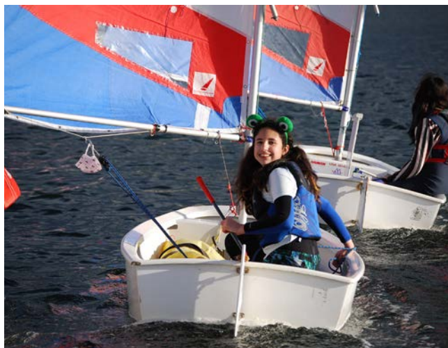
A summer on the water is the best.