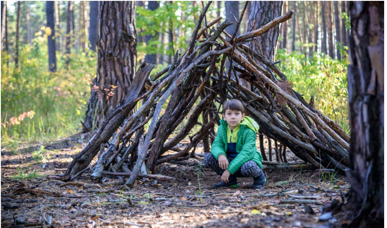
Our Wilderness Survival Camps with Coyle Outside will prepare you for any adventure.