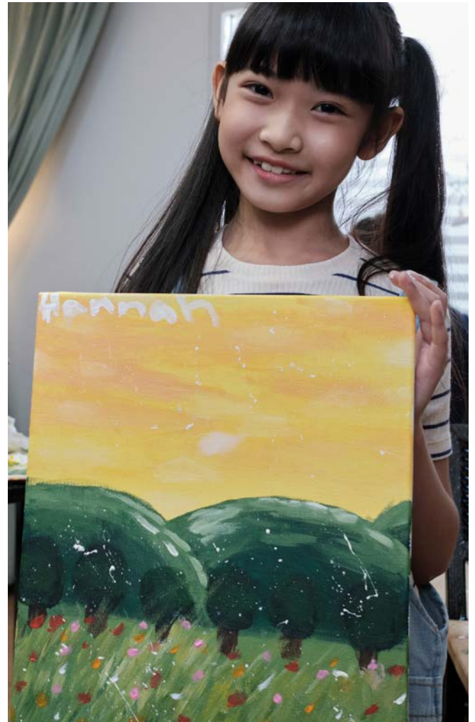
Bring out your inner Monet with Art for Kids.