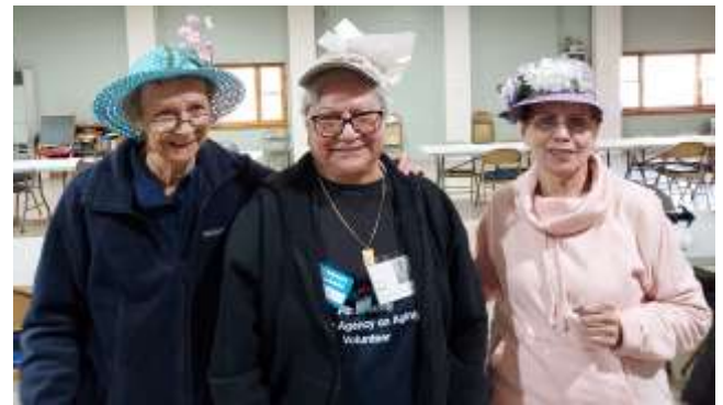
Hat Day Participants at Matamoras PMLE & Saw Creek senior centers