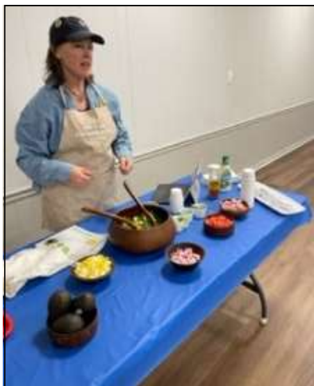
AVOCADO DAY IN MATAMORAS