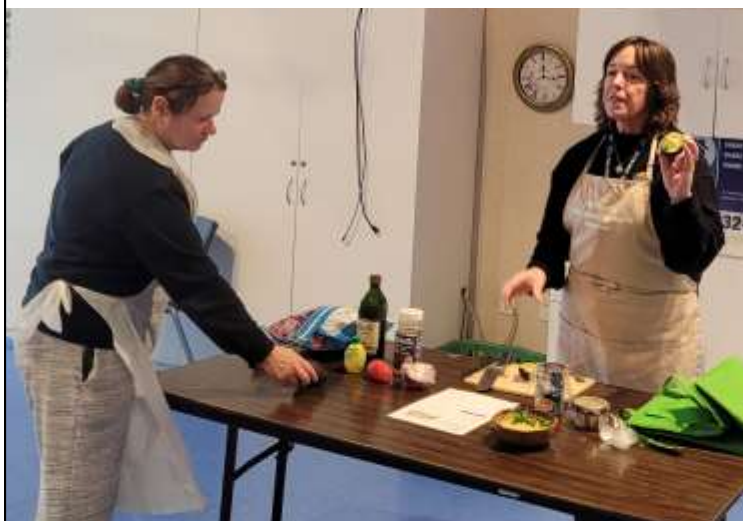
Avocado Day in Blooming Grove