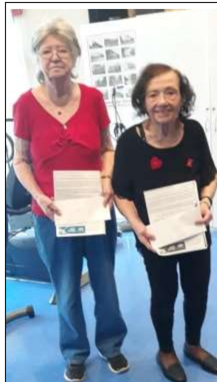
Match Game Winners