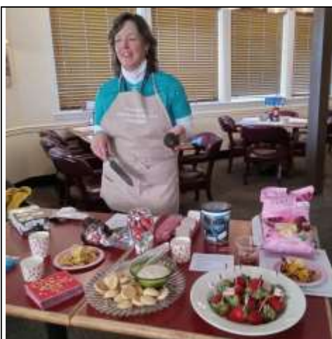
Avocado Day in Saw Creek