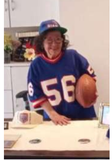
Blooming Grove Halloween