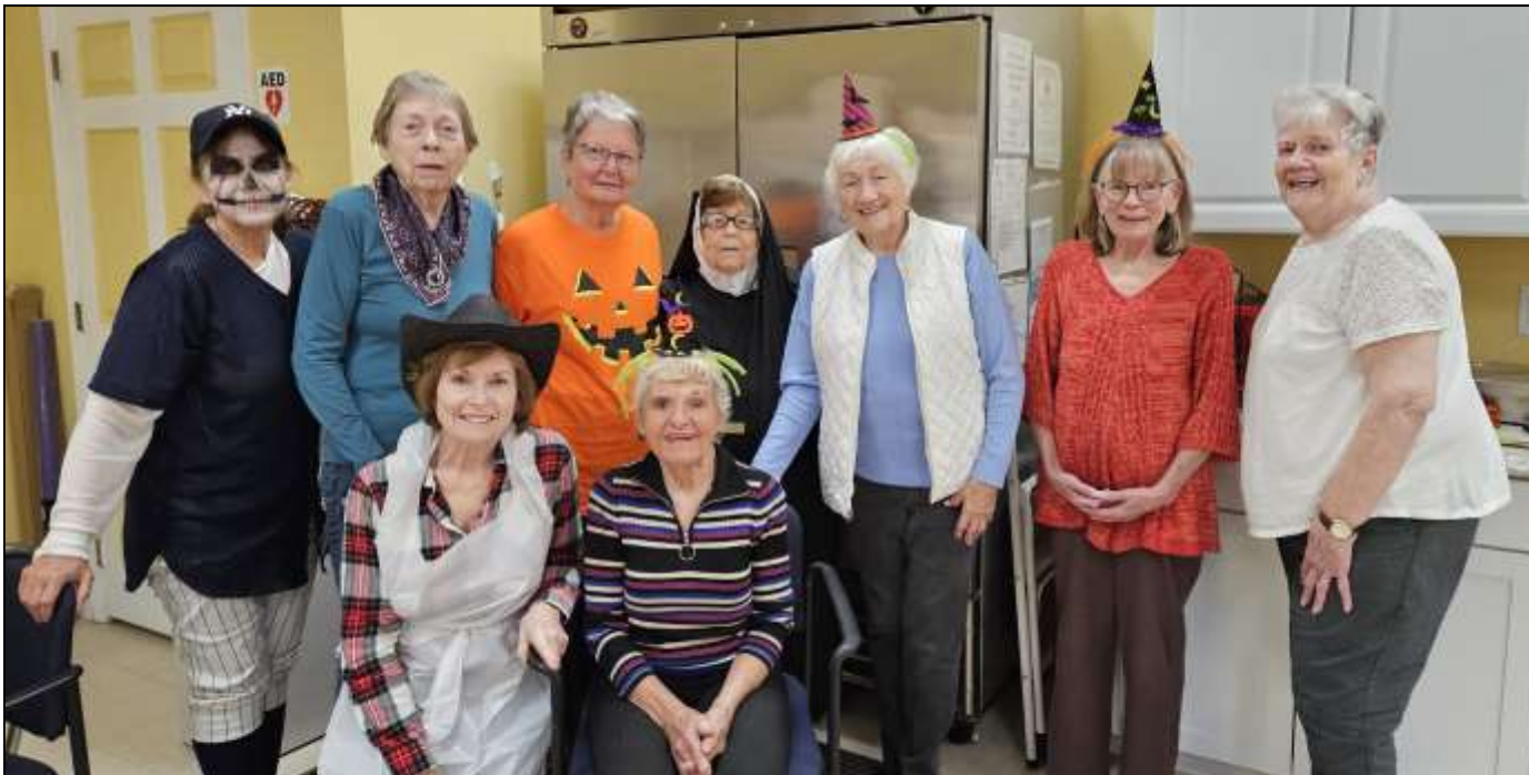
L a c k a w a x e n H a l l o w e e n 10