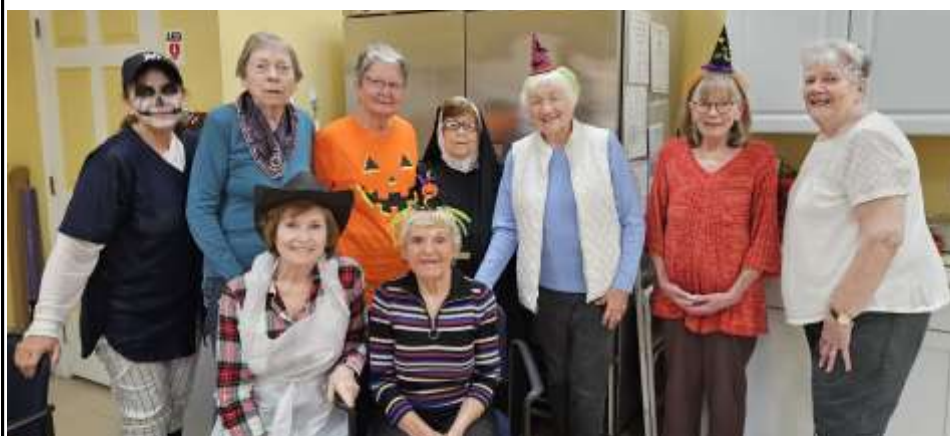
Halloween at Lackawaxen