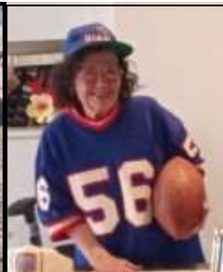
Halloween in Blooming Grove