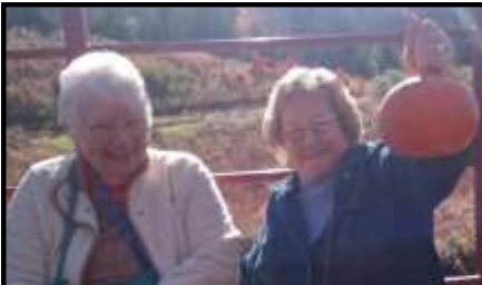
Hay Ride Fun