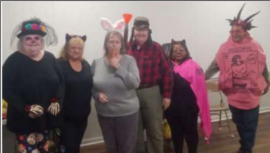
Halloween at Matamoras