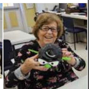
Pumpkin Painting in Lackawaxen