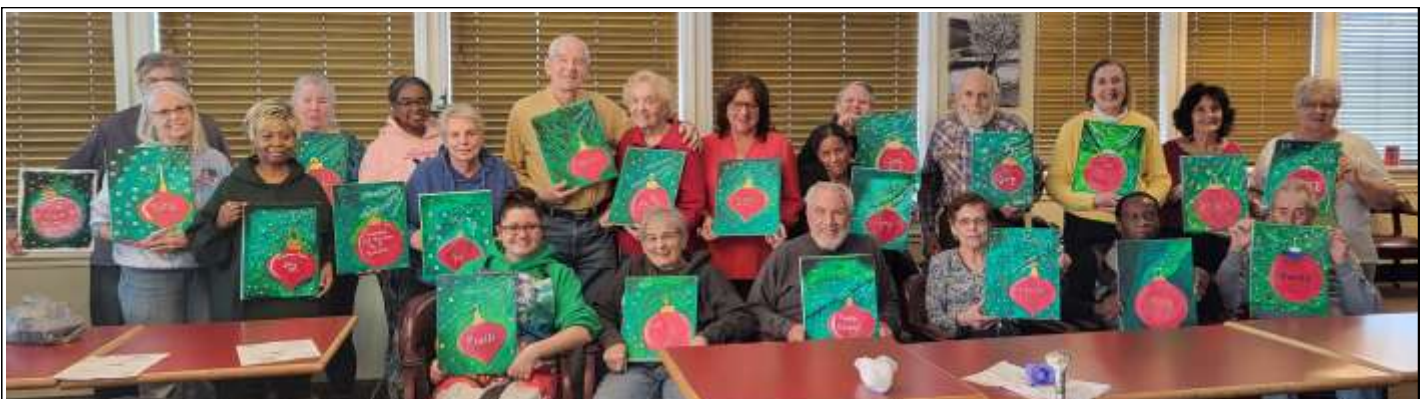
Art Class at Saw Creek