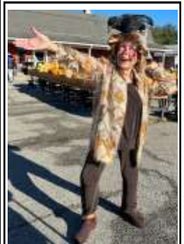
Our in house scarecrow