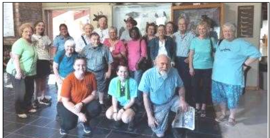
Field Trip to PEEC