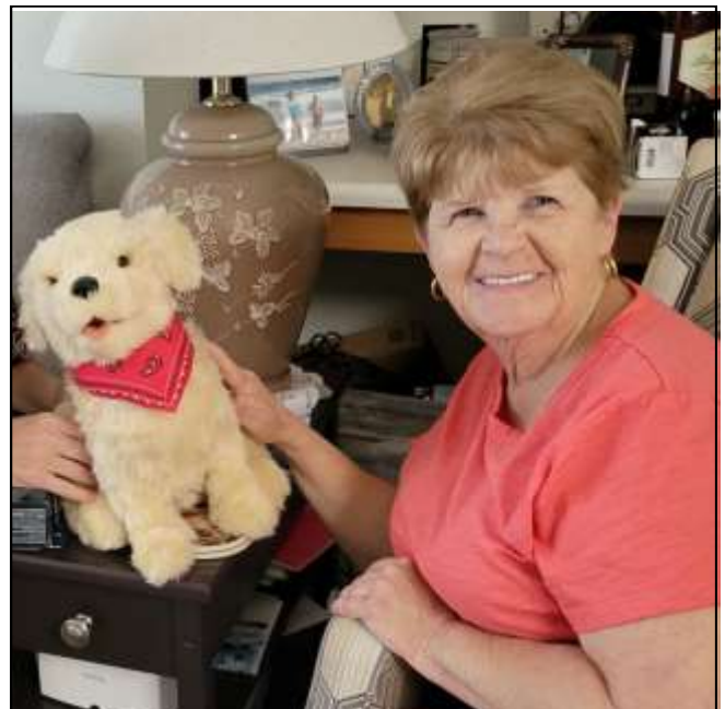
Pet Program Recipient