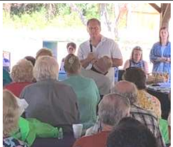
Many consumers participated and benefitted from our Elder Justice Day Presentation.