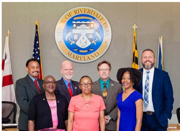
2019-2021 Mayor and Council