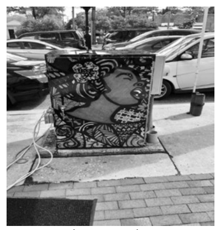
Andrea A Noel, Jazz 6200 block of Rhode Island Avenue

A total of (5) wraps have been installed at the following locations: