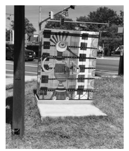
Elyse Harrison, Flying on the Sidewalk 5400 block of Kenilworth Avenue