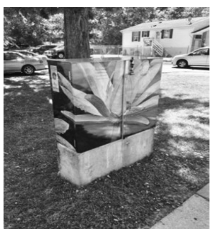
Daniel B. McNeill, White Water Lily 5300 block of Riverdale Road