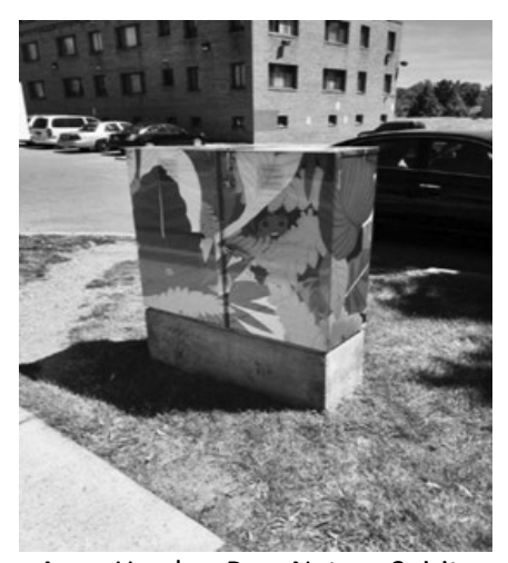
Anna Hayden-Roy, Nature Spirits 5000 block of Riverdale Road