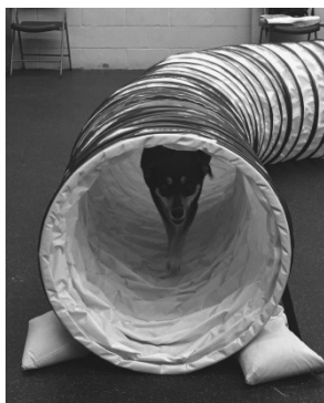
Waggertail's Janey takes the agility tunnel at HRA.

HRA offers manners classes, from Puppy Kindergarten to intermediate level. They offer several beginning dog sports classes, including agility, nose work, and fly ball. There are also excellent classes for dogs that are leash reactive. Perfect for families, HRA offers seminars about dogs and children and they even have a Junior Handler Agility class.