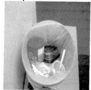
Hide in the trash

Do NOT dispose of medication down the drain or toilet.