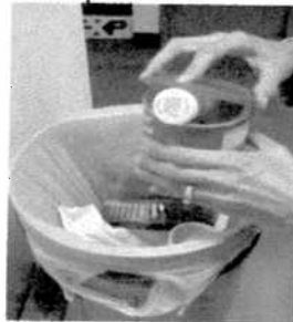
Place in opaque container