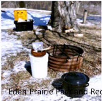
Eden Prairie Park and Rec