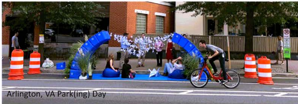
Arlington, VA Park(ing) Day