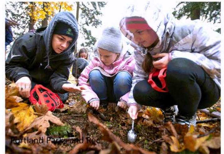
Portland Parks and Rec