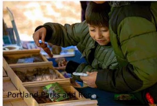
Portland Parks and Rec