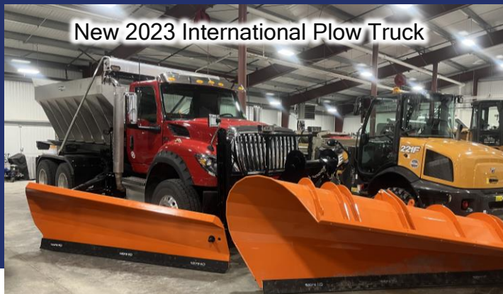
New 2023 International Plow Truck

The Town was awarded $20,000 from the State of Vermont Agency of Commerce and Community Development. This grant will be used to determine the redevelopment feasibility of the old Public Works property on Georgia Shore Road.