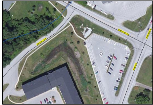
Figure 16. NWMC Pond A

The site is located on private property. The permittee and the Town will need to decide if the expired permit will be incorporated into MS4 or the RDA program. Assistance from the VT DEC will be required to help determine the optimal regulatory approach.