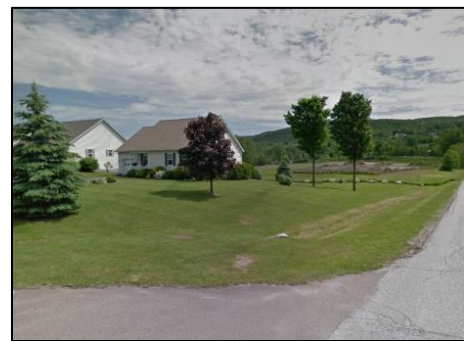
Figure 18. East View subdivision

The proposed project is located on private land and within the Town ROW. The HOA is to be engaged as a partner with the Town for project implementation. Plans for a new sidewalk along Congress Street will need to be considered with BMP implementation.