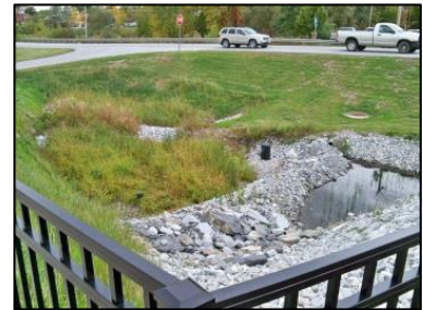
Figure 1. Gravel Wetland at St. Albans Park & Ride

There were several existing permitted sites that do not have volume based or infiltration BMPs and therefore those sites were not included in the model. There were two new pending permits, #6520-INDS and #6602-INDS, with proposed construction that were not included in the Post-2002 model because the permit was unavailable at the time of the plan development. The St. Albans Town Zoning Manager confirmed that the project covered under permit #5841-INDS was on hold indefinitely at the time of model revisions, and therefore the BMPs associated with this project were not added to the model.