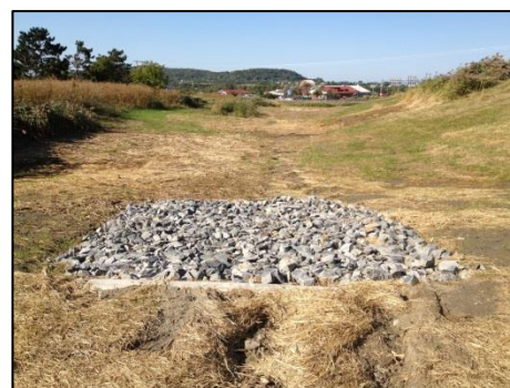
Figure 21. VTrans owned land in I-89 ROW

Eight sites within the VTrans I-89 ROW were identified as potential sites for water quality and flow detention BMPs to detain and treat runoff from I-89. The sites are all located in existing vegetated stormwater conveyances within the I-89 median. Key features of the structures include earthen check dams designed to create up to 1.5 feet of ponding depth behind each dam, amended soils consisting of a 50/50 blend of sand and native soil at the surface, and a pure sand filter below. The structures are designed with a perforated underdrain to be located below the sand filter, connected to the nearest downstream