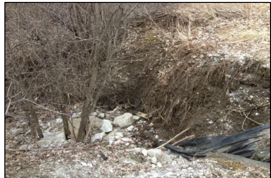
Figure 15. Eroded embankment by Grice Brook Retirement Community

The existing site is permitted under expired permit #1-1194. Runoff from the Grice Brook Retirement Community currently drains from the site via a series of swales and culverts to a steep embankment with significant erosion (see photo at right). Runoff eventually enters the SATEC pond, which is undersized and has limited outlet control. A new pond is proposed at the bottom of the slope to provide water quality benefit and flow control.