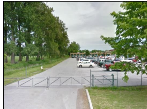
Figure 11. Homeland Security facility parking lot

As the parking lot is part of a federal facility, Homeland Security will need to be engaged as a partner with the City for implementing the retrofit project.