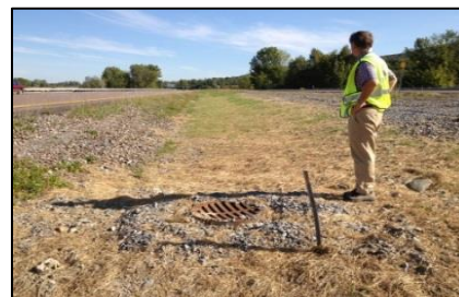
Figure 2. Five proposed swales for VTrans median in credits model

The team then conducted an initial desktop assessment of the watershed to identify open spaces ideal for BMP implementation with priority on City and Town owned land. In addition, the location of BMPs was considered so that storage could be provided throughout the watershed and focused on areas with a high percentage of impervious coverage where flows were expected to be highest. After an initial list of retrofits were identified, a field assessment was completed at each site documenting the engineering feasibility of each retrofit including utility conflicts, natural resources, transportation constraints, collateral benefits (visibility and pedestrian safety), ease of Operation and Maintenance (O&M), and the amount of impervious treated. The team also verified drainage areas for the proposed BMPs. The proposed BMPs were then designed using HydroCAD to meet the CP v storage criteria for warm waters. CP v estimates for each BMP are summarized in Table A-2 (Appendix 2), along with HydroCAD model outputs in Appendix 3.