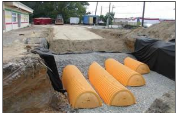
Figure 6. An underground storage system

An underground storage system is proposed for implementation on a City owned parcel, located North of 65 Bishop Street, possibly extending onto adjacent private land (Figure 6). The site is one of few open spaces within the large residential area east of the City downtown. A new stormwater line would divert flow from an existing catch basin capturing a 33-acre drainage area. An easement would be required in order to implement the new stormwater line. Acquisition of adjacent private land would be required to accommodate the entire structure. The BMP is proposed on City owned land but also may extend onto adjacent private land. To route flow into the BMP, an easement would be required across private properties.