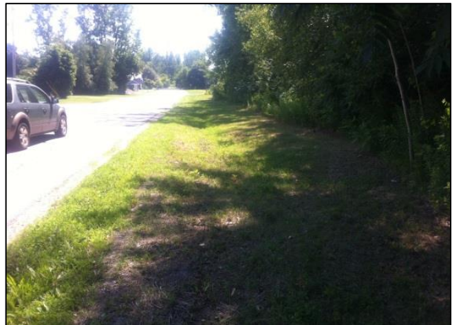
Figure 8. Lemnah Drive

The proposed project is on City owned land and redevelopment plans along Lemnah Drive could impact BMP placement. There is potential for incorporating the retrofit with the stormwater management needs of the planned Lemnah Drive redevelopment project.