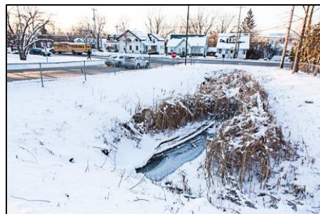
Figure 3. SATEC Basin

The site is located on the school property. The school and the City will need to decide if the expired permit will be incorporated into MS4 or the Residual Designation Authority (RDA) program. Assistance from VT DEC will be required to help determine the optimal regulatory approach.