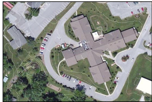
Figure 17. NWMC Pond B

The permittee and the Town will need to decide if the expired permit will be incorporated into MS4 or the RDA program. Assistance from the VT DEC will be required to help determine the optimal regulatory approach.