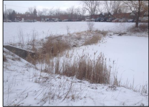
Figure 14. NWMC's main pond

The existing Northwestern Medical Center (NWMC) main pond is permitted under expired permit #1-1477. Available open space adjacent to the existing stormwater pond and the expired permit make this site ideal for retrofit. The goal with the retrofit would be to route additional drainage to the expanded pond from the Hill Farm Estates subdivision (under expired permit #1-0650) north of the medical center, and upgrade the pond to 2002 VTSWMM standards.