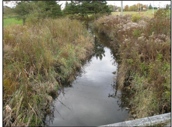
Figure 5. Hungerford Lower Basin

A large scale retrofit project (feasibility and preliminary design completed under the Enterprise Resource Planning contract #29-18102) is proposed on the Hungerford property within the Town (Figure 5). Runoff is proposed to be routed from the Stevens Brook impaired watershed into a water quality treatment and flow detention structure on the Hungerford Family Trust property. The BMP is estimated to provide over 20% of the flow target reduction.