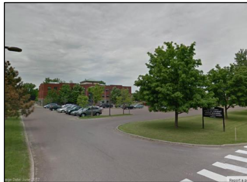
Figure 12. Project site by the State's facility on Houghton Street

The project site is owned by the State of Vermont. Implementing a retrofit on State property would support the Vermont Governor's Green Infrastructure Initiative.