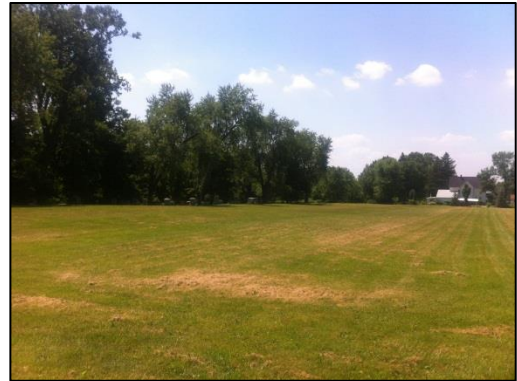
Figure 7. Open land adjacent to the Greenwood Cemetery

The BMP is proposed on private land, which may be reserved for expansion of the existing cemetery. An alternative BMP design is possible within the City ROW, on Upper Gilman Road, if it is deemed infeasible to use the private land for the proposed BMP.