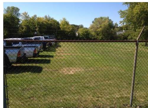
Figure 13. Open lot on Maple Street for shallow infiltration and flow detention

The proposed project would be located on private land and within the City ROW. The landowner would need to be engaged as a partner with the City for project implementation.