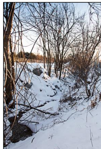
Figure 9. Drainage way, east of S.B. Collins Property

Additional assistance from the VT DEC will be required to help determine the optimal regulatory approach.