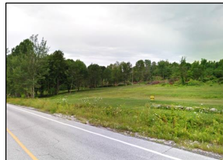
Figure 19. Private land on Fairfield Hill Road

Private land would need to be acquired in order to implement the BMP, and the land was advertised for sale as of November 2013. The benefit of the proposed facility location is the ability to control flow at the top of the watershed before stormwater flows enter the main stream channel and gain velocity and erosive strength.