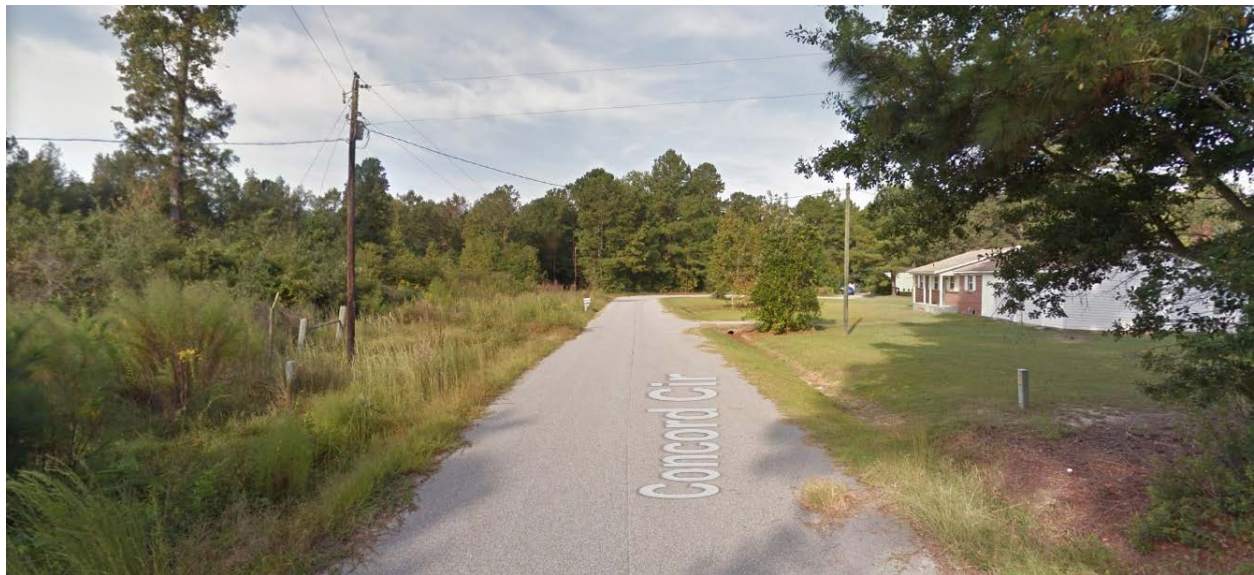
View of the property from Concord Cir. The undeveloped property is on the left side of the road.

The applicant is requesting this rezoning in order to facilitate future commercial development on the undeveloped site. Per the applicant, the site is envisioned to be a strip mall with vacant tenant space available for rent. Some businesses that were suggested included a barbershop, beauty shop, restaurant, and a specialty store.