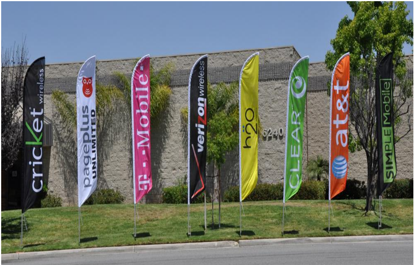
Sample Feather Flags

Request: Amend relevant portions Article 8, Section I: Sign Regulations of the Sumter County Development Standards Ordinance to allow certain fluttering devices, including feather flags in the County.