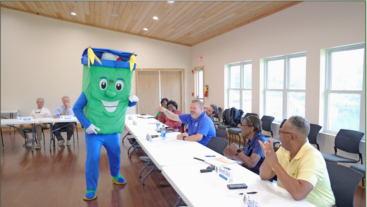
A new mascot known informally as 'Trashy' meets members of the Sumter Litter Advisory Board at its last meeting.

The Sumter Litter Advisory Board heard updates from the City, County and state during its August 21, 2023, meeting.