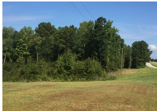
Left: Frontal View of the property from Thomas Sumter Hwy. Right: View of Property from driveway of New Beginnings Ministries

Below, an aerial photograph shows the relationship between the subject property and neighboring properties. With the exception of the church, all other neighboring parcels are rural and undeveloped.