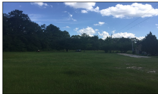
Above Right: Southern Parcel

The northern parcel is bisected by an extension of the private dirt road owned by the family of the applicant. Although one of the parcels abuts Thomas Sumter Hwy., legal access is from Dock Road.