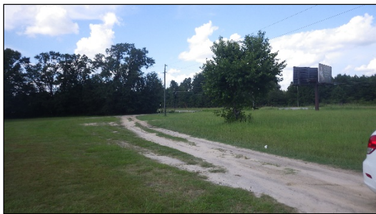
Above Left: The Northern Parcel.

The Planning Director further stated that the subject properties are two of the remaining undeveloped lots within the subdivision. These lots were created prior to the 1999 zoning ordinance and highway corridor strip commercial zoning. The photographs below show the properties as they are today.