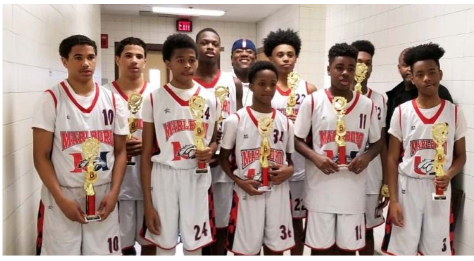
MBGC Boys Basketball 14U won the County Championship!

The mission of the Marlboro Boys & Girls Club is to provide a positive environment that encourages learning and a venue conducive to a progressive future for all youths who participate. Principles of good