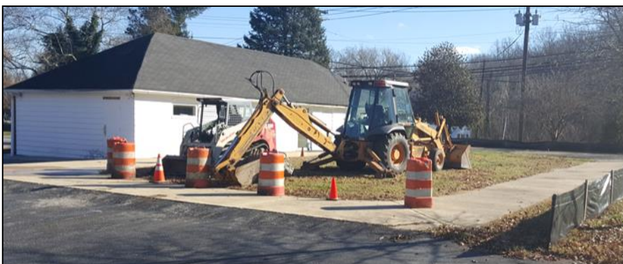
Expansion & Renovation of the Town Hall Offices to Include An Enhanced Meeting Area for Town Committees & Events

Updating of Town Ordinances and Development of a "Town Code" to Help Enable Successful Enforcement of Common Property Standards Issues