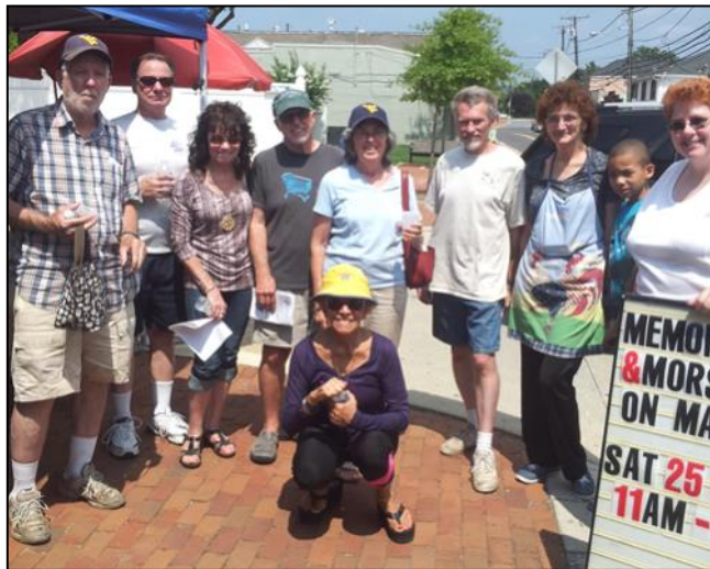
Town-Sponsored Events to Increase Community Awareness On the Importance of Historic Preservation and the Environment