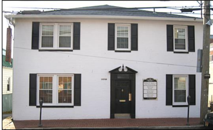
Downtown/Main Street Revitalization Enabled Through the Façade Improvement Project, Funded by Sustainable Communities Grants Administered By The Town