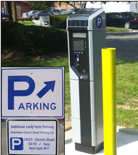
Upgrades to the Town-Owned Public Parking Lot Offering Additional Payment Options and Long-Term Parking