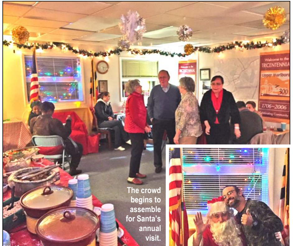
The crowd begins to assemble for Santa's annual visit.