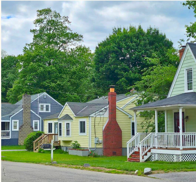
Pictured: A row of houses in Upper Marlboro, MD

This is a friendly reminder of the Town's community standards and code compliance requirements so that together, we can continue to make Upper Marlboro a place we can be proud to call home.