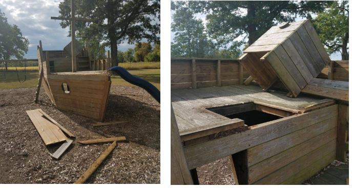
Most recent damage done to play-scapes at Sexton Park on Leaver St.

There has been a significant amount of vandalism recently throughout the Village including the parks. Our Police Department needs help with information regarding any suspicious activity that could help put a stop to vandalism. All information will be kept confidential. Please contact our Police Department at 989-288-2300.