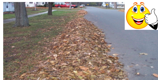
Correct placement for leaf pickup.