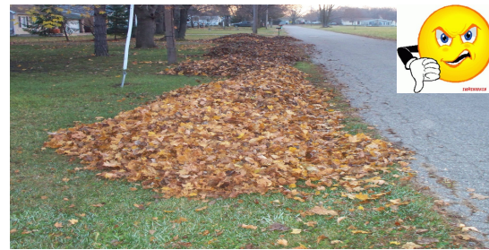
Wrong way to place leaves for pickup.

Leaves may still be taken to the compost lot located on W. Main St. Your patience and understanding during the season is appreciated. Thank you!