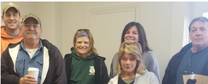
Some of our Spring Clean up volunteers