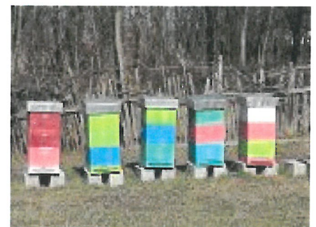
Honey Bee Colonies