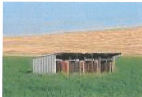
Leafcutter Bee Hive