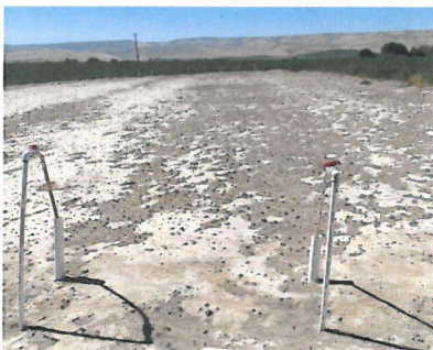
Alkali Bee Bed

You may be asking what does this have to do with me? First of all the bees are just one of the many things that make Walla Walla County a unique and wonderful place to live. These bees have a job to do and bring quite a bit of local revenue by way of pollination. They are big economic business for this Valley. The bees on your property can impact your neighbors financially. There have already been ten code cases this year that have stemmed from bee complaints. Finally, many of you have been approached by individuals or companies that offer to pay you to house their bees on your property. They are not your bees, you do not care for and/or maintain them and it is easy to think of them as not being your responsibility. However, as a property owner in Walla Walla County you are the one responsible for any violations of code on your property and those infractions could be up to $250 a day. Please call our office (509-524-2616) and we will help you to figure out the allowable amount of bees you can have in a given zone or on a given property before placing bees on your property. Let’s figure it out together before bee season becomes violation season.