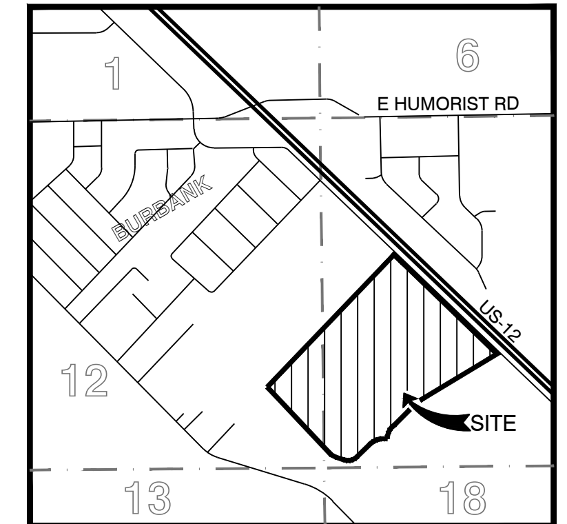
VICINITY MAP 1"=2,000'

PRELIMINARY PLAT FOR A SINGLE-FAMILY RESIDENTIAL SUBDIVISION LOCATED IN THE SW ¼ OF SEC 7, T 8 N, R 31 E AND THE SE ¼ OF SEC 12, T 8 N, R 30 E OF THE WILLAMETTE MERIDIAN