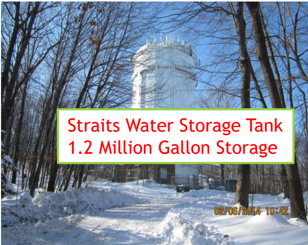
Straits Water Storage Tank 1.2 Million Gallon Storage