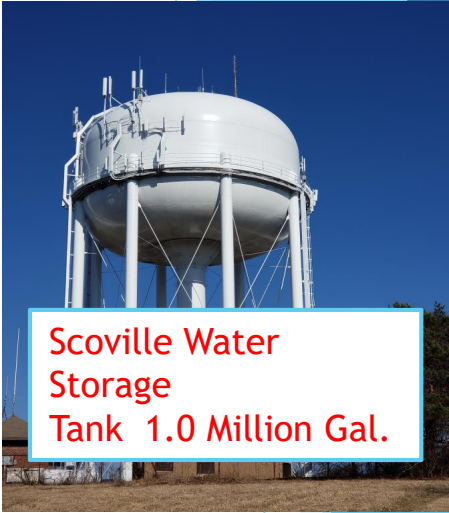
Scoville Water Storage Tank 1.0 Million Gal.