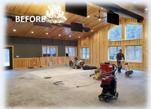
Camp Wa-No-Ki Lodge Floor