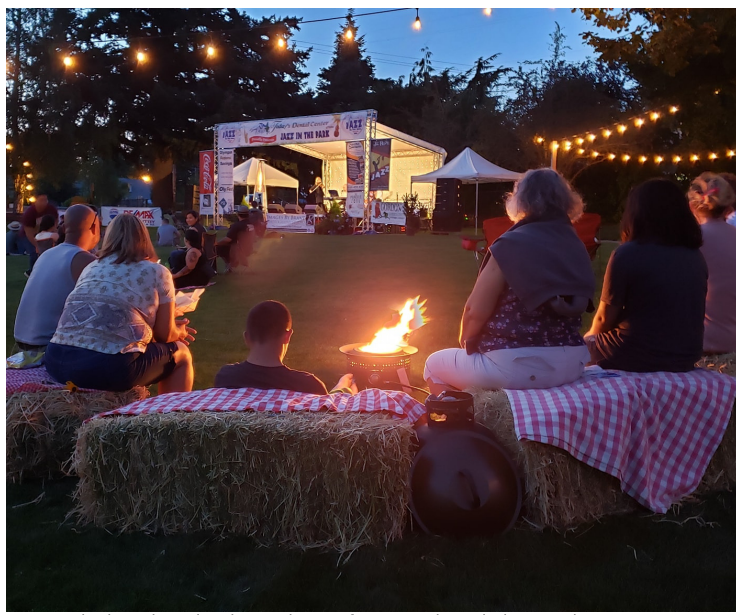
String lights, hay bails and gas fire pits lined the park, transporting festival goers to a vacation state of mind.