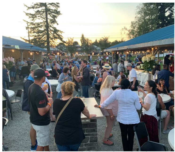
Hundreds of people lounge in the beer garden at the 3rd annual Jazz in the Park Festival.