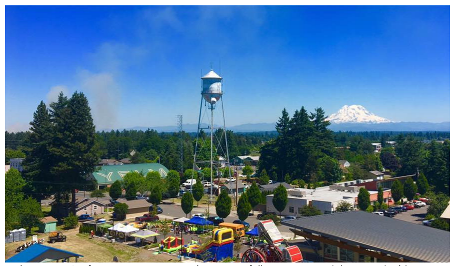
The iconic 125-foot water tower is undergoing a full restoration, while a new building will house a satellite branch of South Puget Sound Community College and a business incubator space.

Through two new projects funded by the Washington State Legislature, the City of Yelm is simultaneously preserving the past while looking to the future. Click on the picture for the entire article or visit www.yelmonline.com.