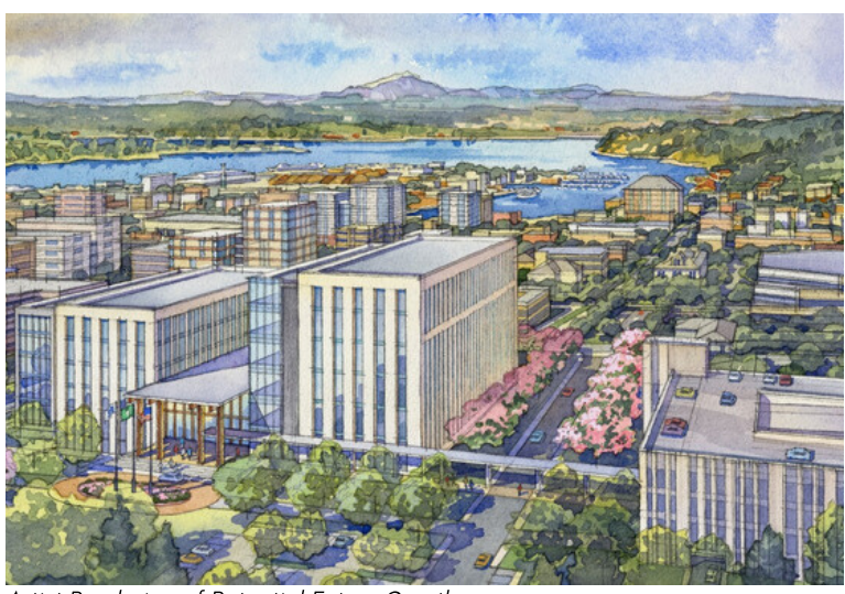
Artist Rendering of Potential Future Courthouse

The $250 million bond measure will construct court and administrative facilities to better meet the needs of Thurston County's growing population, provide additional parking downtown, and will meet the requirements of the Americans with Disabilities Act. The bond will go before the vote of the people February 11, 2020.