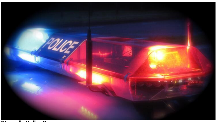
Nisqually Valley News

The owner of Farwell's Fine Jewelry in Yelm drew a weapon and halted a would-be robber until police could arrive after the man attempted to steal a ring valued at $2,400 Wednesday afternoon, according to the Yelm Police Department.