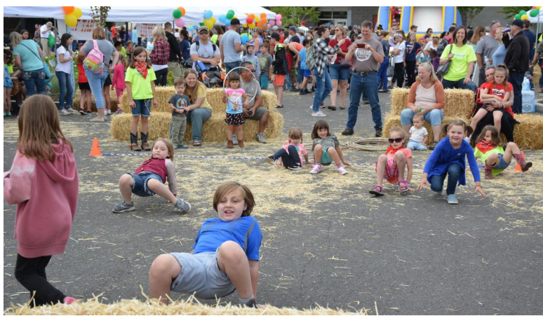
Kids at Yelm's Prairie Days enjoy a crab-walking race Saturday, June 29, at Yelm City Park.

Click on the picture for the entire article or visit www.yelmonline.com