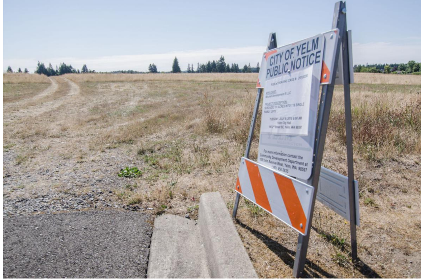
A public notice sign sits at the soon-to-be entrance of The Hutch, just off Killion Road. About 19.5 acres will be parceled up into 118 single-family dwelling lots.

Click on the picture for the entire article or visit www.yelmonline.com.