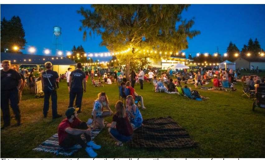
This two evening event is free, family-friendly fun with music, dancing, food, and community.

Click on the picture for the entire article or visit www.Thurstontalk.com