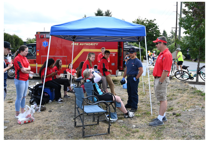
Southeast Thurston Fire and the Yelm High School Sports Medicine students provide first aid at the mini-stop in Yelm