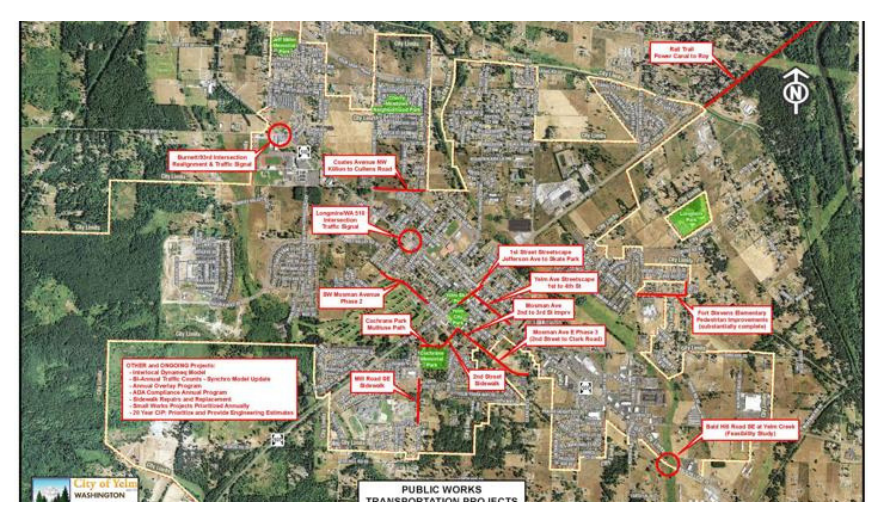
A map shows all of the projects listed in the six-year transportation improvement plan, approved by the Yelm City Council Tuesday, July 9.

Click on the picture for the entire article or visit www.yelmonline.com