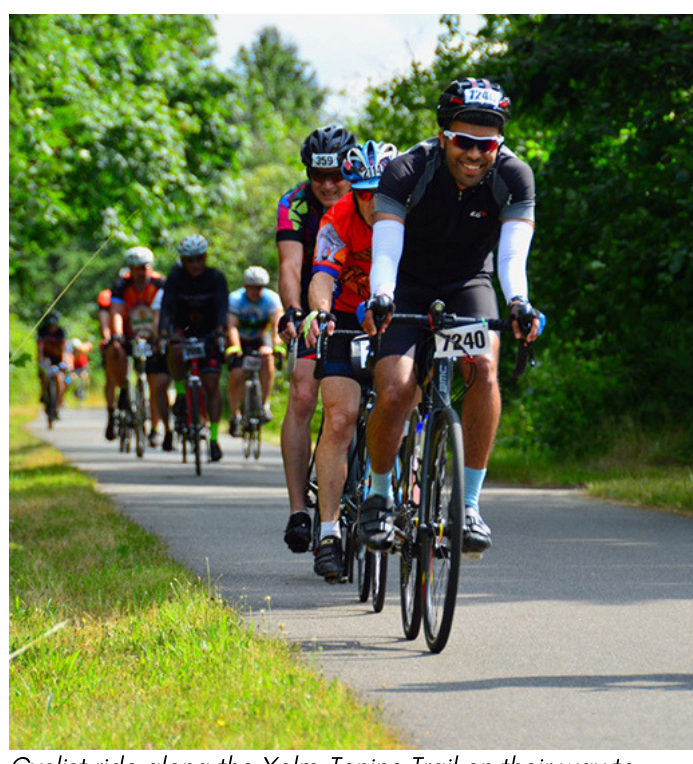
Cyclist ride along the Yelm-Tenino Trail on their way to Portland.

Thank you again to all of our residents and commuters for your patience and caution as these cyclists traveled through or City.