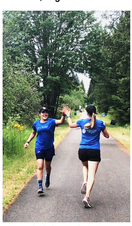
Runners high-five as they run past each other at the annual 5K for the Fallen