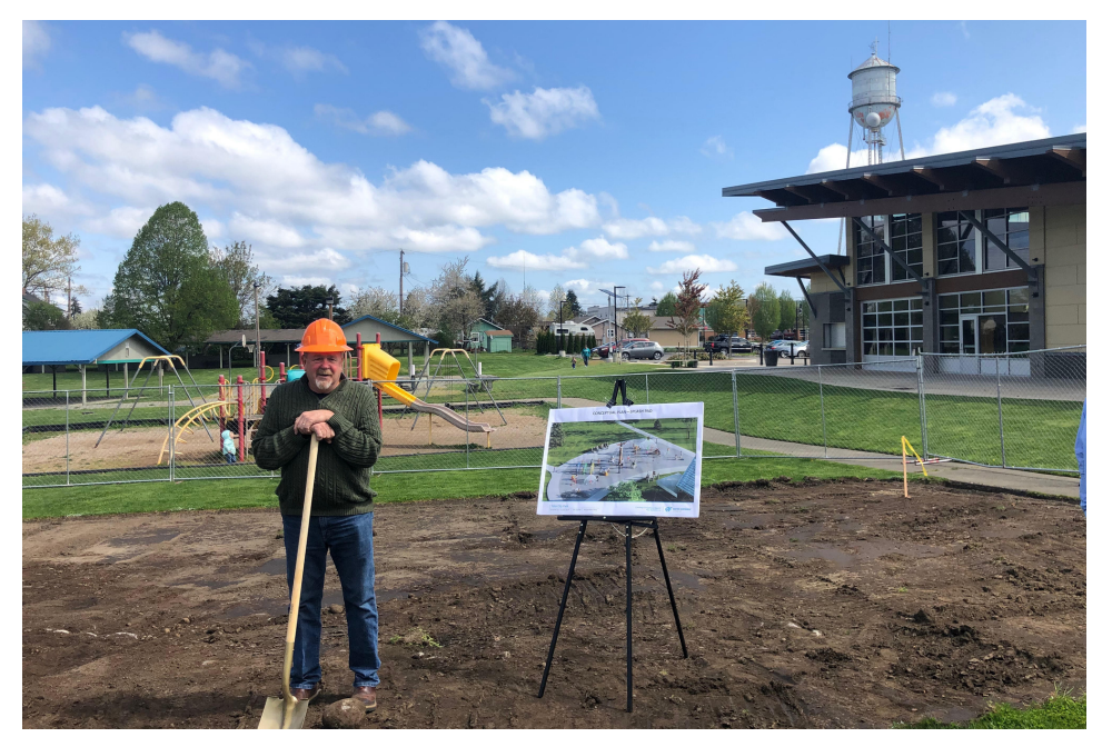
Mayor JW Foster opens the ground breaking ceremony for the Splash Park in late April.