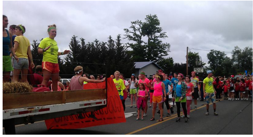
Prairie Days will feature a community street dance along with a 5K and multiple activities for families.

It's hard to believe, but just three short years ago, the City of Yelm hosted only two events annually: the Prairie Days celebration and Christmas in the Park. Click on the picture for the entire article.