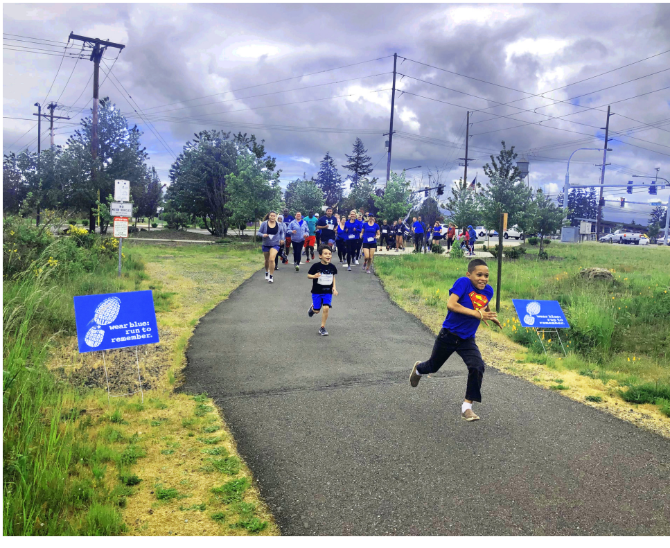
Runners take off along the Yelm-Tenino trail at last Friday's 5K for the Fallen

The 5K began with a circle of remembrance where participants shared the name of every soldier they were dedicating their 5K to and then honored our fallen service members with a moment of silence. After the names were shared, participants took to the Yelm-