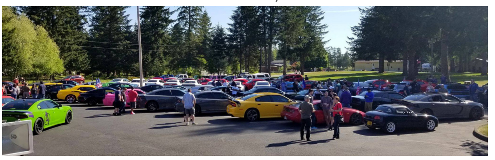
More than 150 community members turned out last weekend to celebrate the building of Sgt. Aaron Boyle's new home.