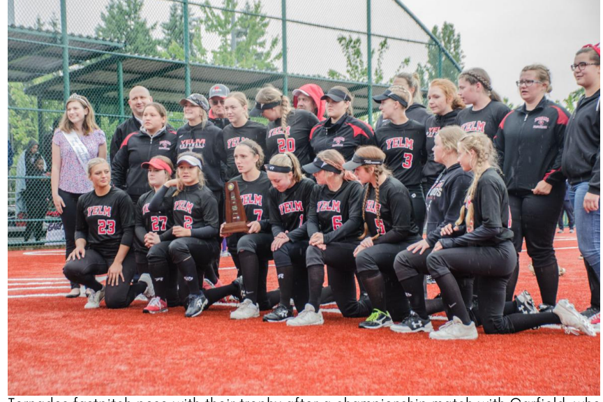
Tornados fastpitch pose with their trophy after a championship match with Garfield, who won it out 10-4 against Yelm.

Click on the picture for the entire article.