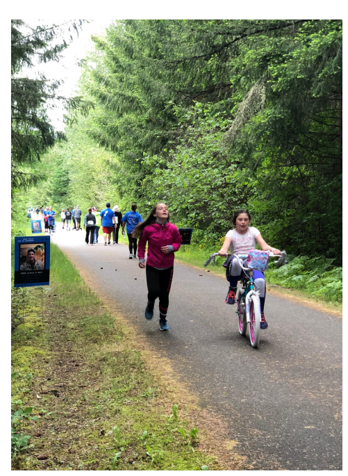
People of all ages came out to run, walk and bike along the Yelm-Tenino Trail.

"Today we are going to ground our steps by taking the time to speak their names. By speaking their names we are able to carry their lives and their stories with us."