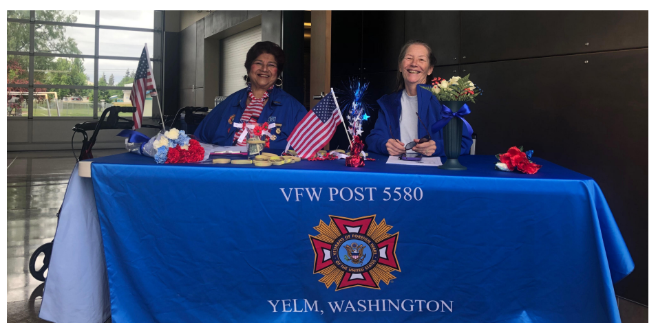
Members of the Yelm Veterans of Foreign Wars post 5580 hand out poppies to runners in remembrance of our fallen service members.