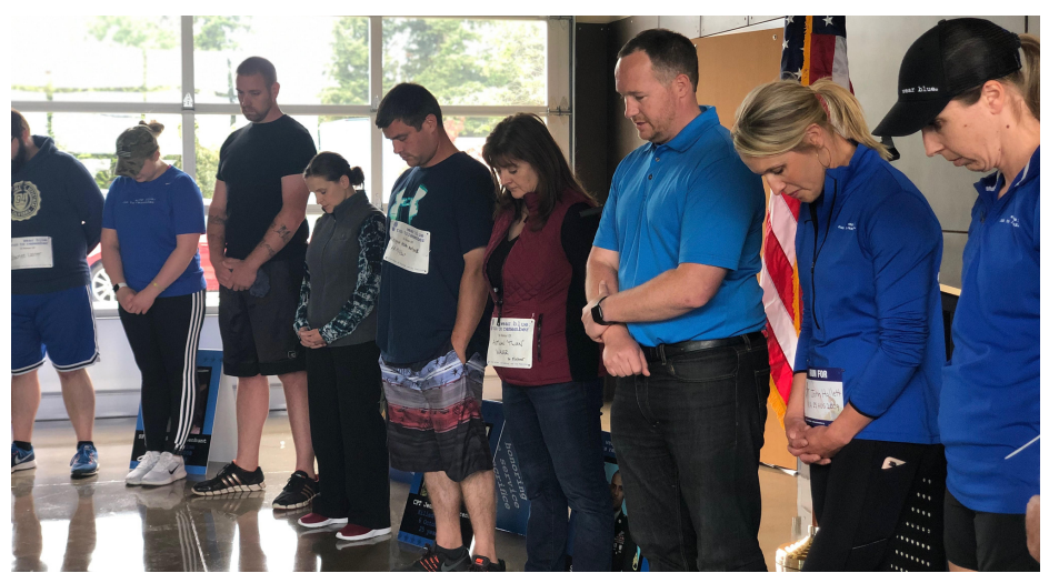
Runners, walkers and bike riders gather in a circle of remembrance and speak the name of the person they are running for before taking to the Yelm-Tenino Trail.