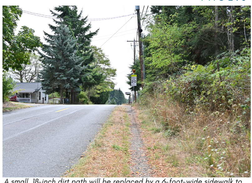
A small, 18-inch dirt path will be replaced by a 6-foot-wide sidewalk to improve pedestrian safety before the next school year.

The project is listed in the six-year Capital Improvement Program, and the