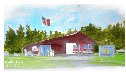
Rendering provided by Coates Design Architects

The Fire Authority intends to apply for a $900,000 facilities grant from the state and garnering the official support of the Council will help advance their