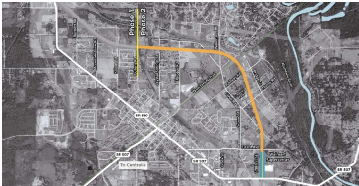
To participate in the online open house, please click on either of the images above or visit https://engage.wsdot.wa.gov

The open house website is an informative opportunity for new and existing community members to seek the latestinformation regarding the reduction in travel times, traffic volumes, and the safety and mobility enhancements that are included in this project.