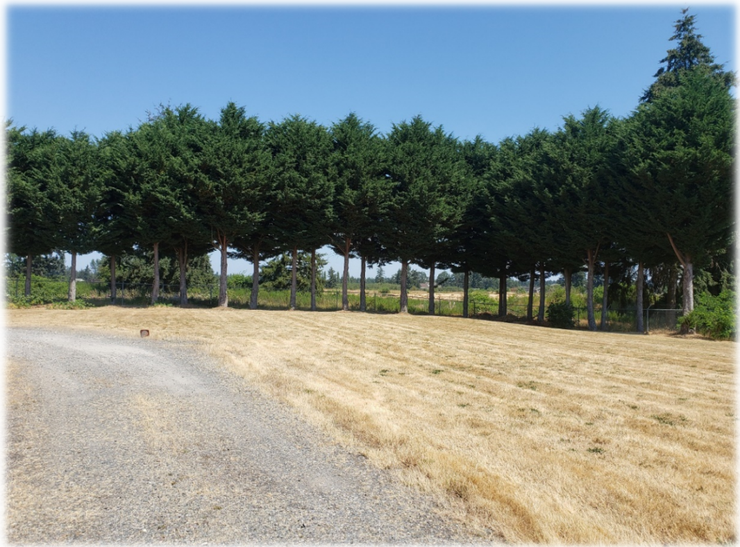
Existing Site Photos (7/27/2022) City of Yelm Vehicle Storage facility