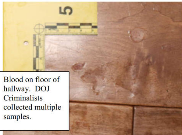
Blood on floor of hallway. DOJ Criminalists collected multiple samples.