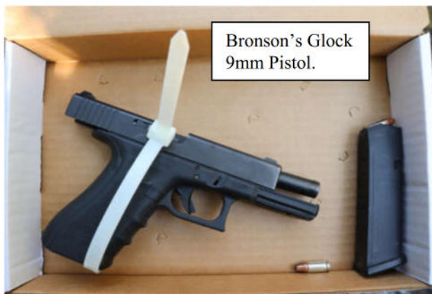
Bronson's Glock 9mm Pistol.