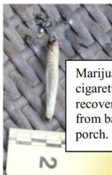
Marijuana cigarette recovered from back porch.

The OIS investigation team also requested assistance from crime scene experts from the California Department of Justice Bureau of Forensic Services ("DOJ"). California DOJ Senior Criminalist Brandi Spas arrived at approximately 6:50 a.m. The OIS team members and DOJ criminalists processed the scene, photographing each item of evidence before collecting it. The team collected more than a dozen items of evidence, including a partially burned marijuana cigarette located on the back porch, a small baggie of marijuana, five fired 9mm cartridge cases and some bullet fragments from the bathroom, and a black and red hat from the floor of the hallway.