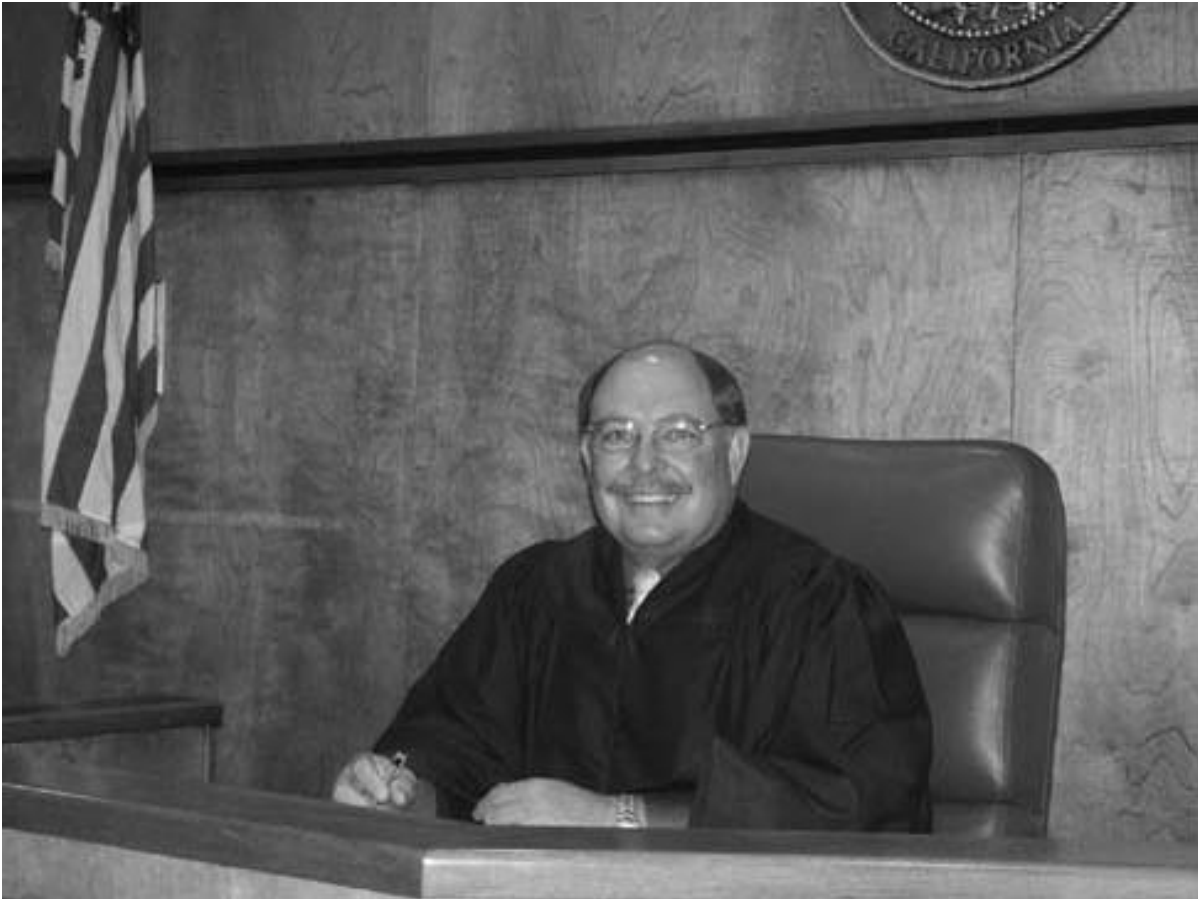
The Honorable DAVID E. WASILENKO Judge of the Superior Court Department 4